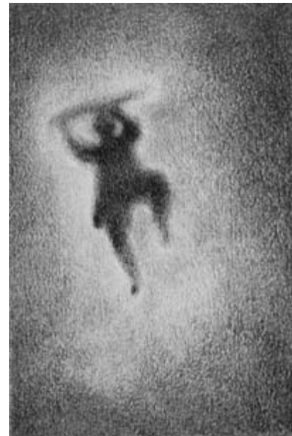
Zoomed in photos of possible flying "SuperFan" by Parker Pent