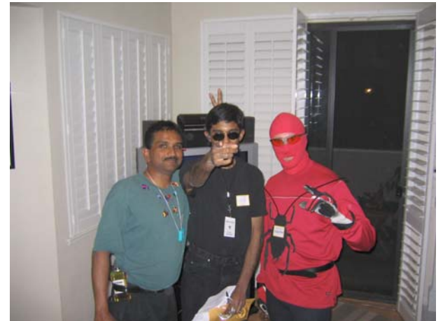
"We want you!" AFMan, NBrawler & Cockey