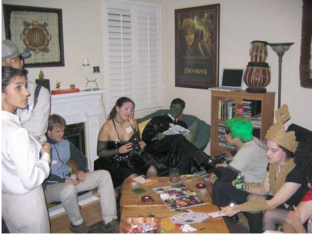
The MySH/MoSH lounge