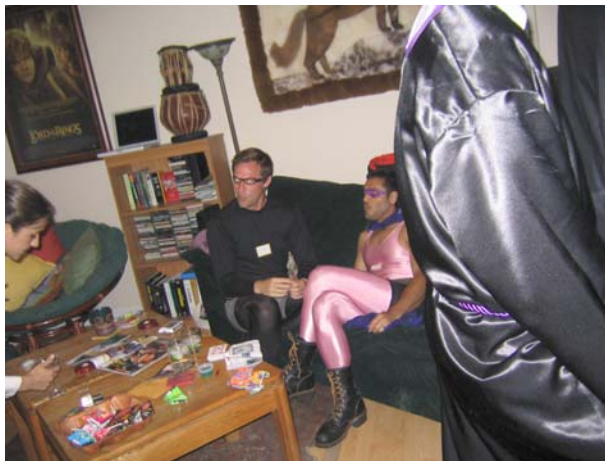
Dynamic Duo aka Sofa Tubers