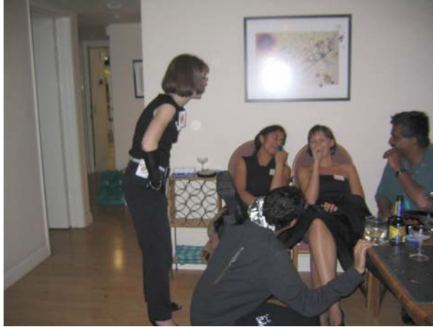
MySH/MoSH giggling dining area