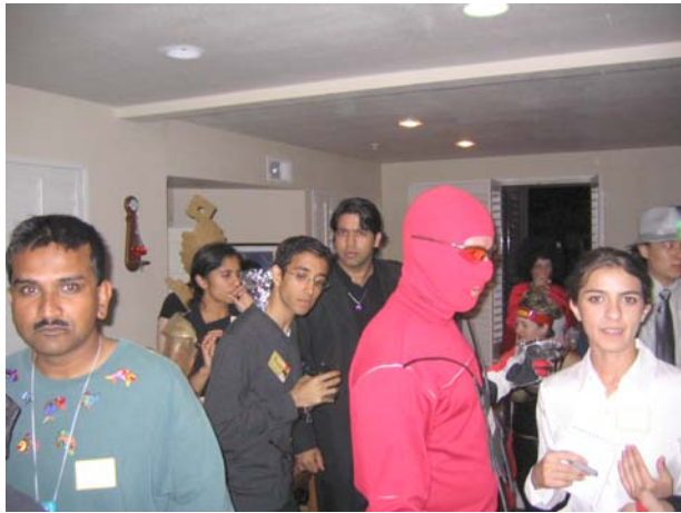
Whoa, the scene is intense!