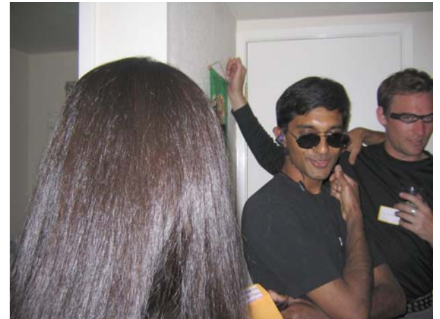
Poison Oak (aka Cousin It) & NBrawler & Robbem