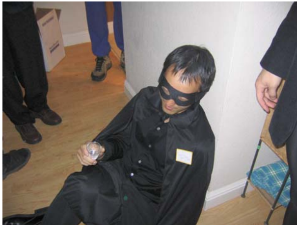
Deal Devil Death Diatribe scene