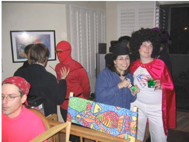
Mesquite, "The Green stuff is lickety good!"