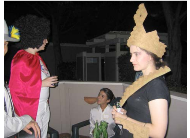
Windy out on the deck