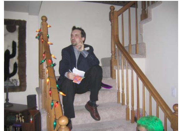
?'er lost his voice