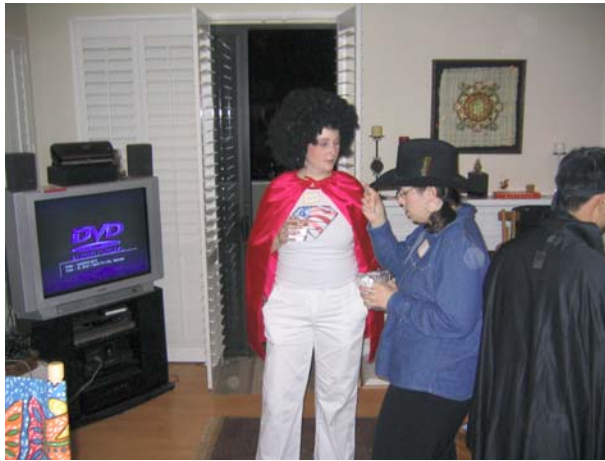
Supercurl & Mesquite