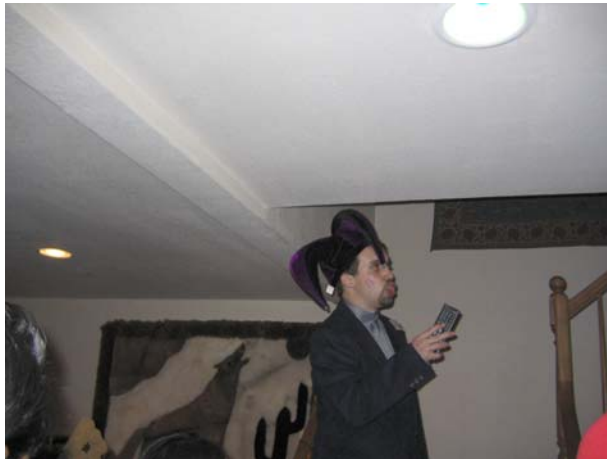
?'er "Behave or I'll change the channel!"