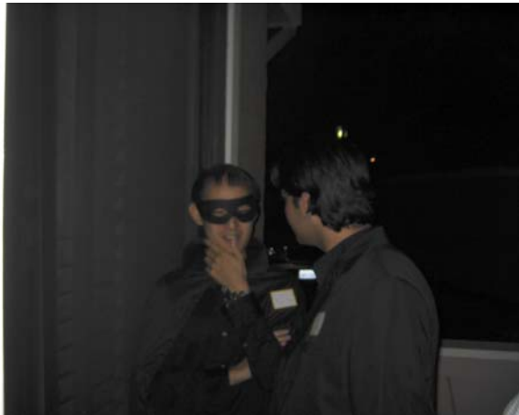
Deal Devil dealing with Governor Lexor