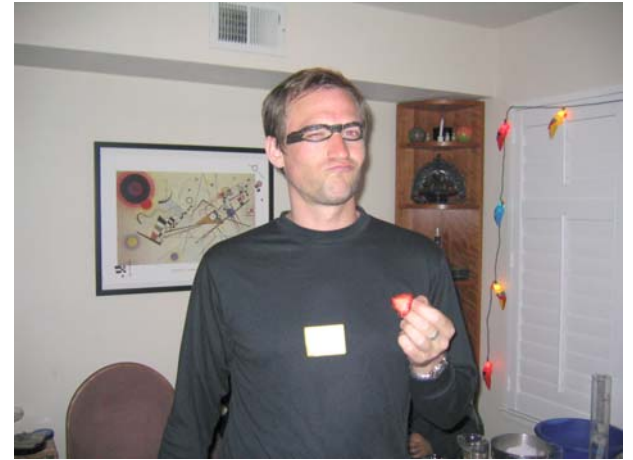
"Scrumptious strawberries!" - Robbem