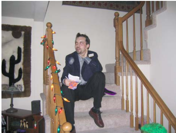
?'er losing his voice