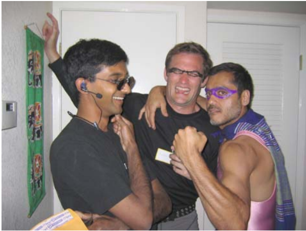
NBrawler fearing Badman's fist & Robbem's tongue