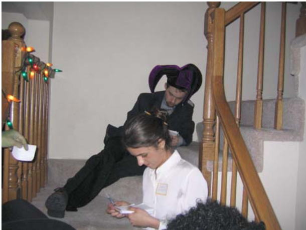
?'er going through the ballots