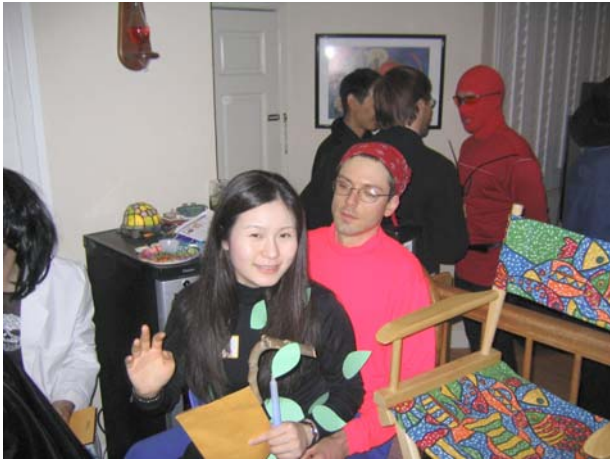
Poison Oak under the influence of Capt Armenia?