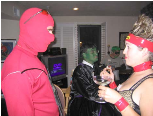
Cockroachman & Wonderbra Woman (green goobers in distance)