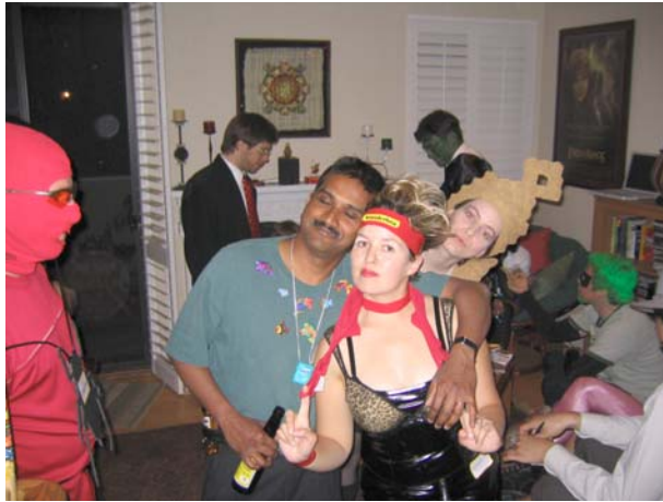
AFMan, WBWoman, & WindyTWG - nearing the end of the night