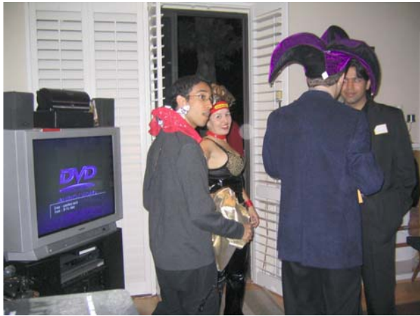
Mag Guy gaping at Questioner's price tag with WBW star smile