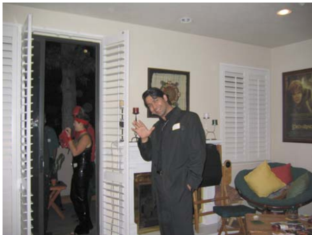
I'm seeing a theme here - Luth