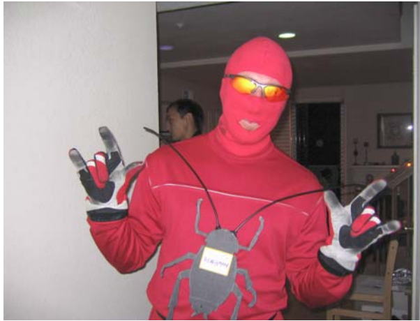
Cockroachman (aka Cockey)