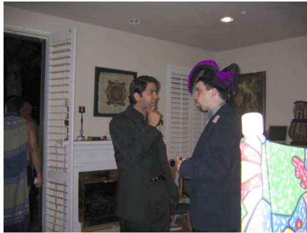
Luth & ?'er collusion?