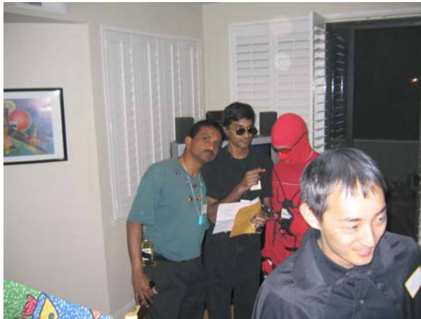
"Maybe he did it?" AFMan, NBrawler & Cockey discuss DDevil