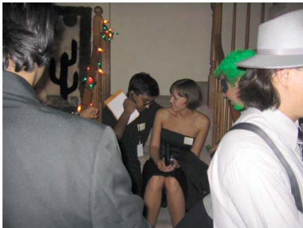
Security (Nightbrawler) checking Elect-Ra's ID.