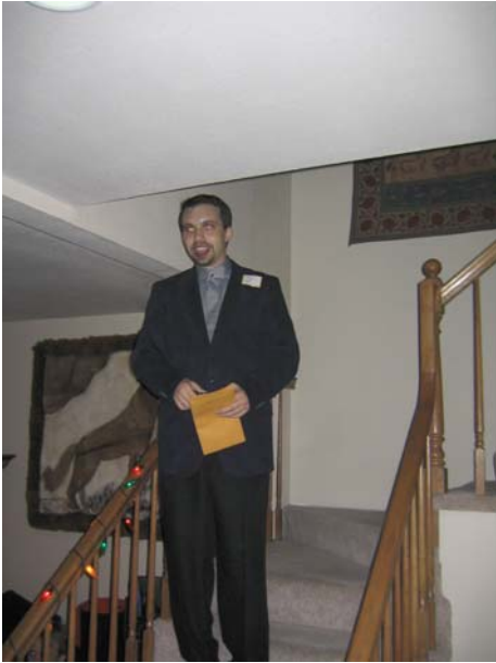
The Host Speaks again!