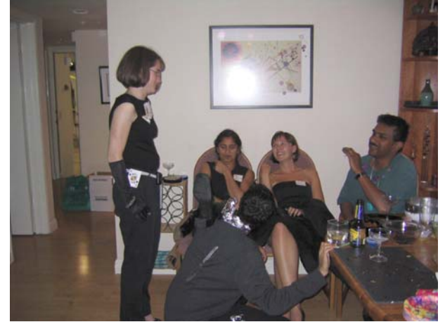
MySH/MoSH giggling dining area cont.