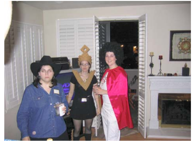
Mesquite, Windy & Supercurl caught in the act