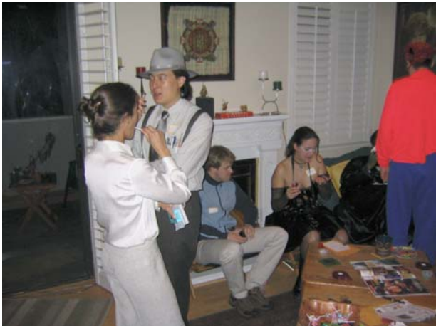
MySH/MoSH lounge cont.