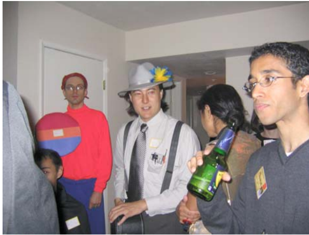
Kingpen jealous of Magnetic Guy's fuel