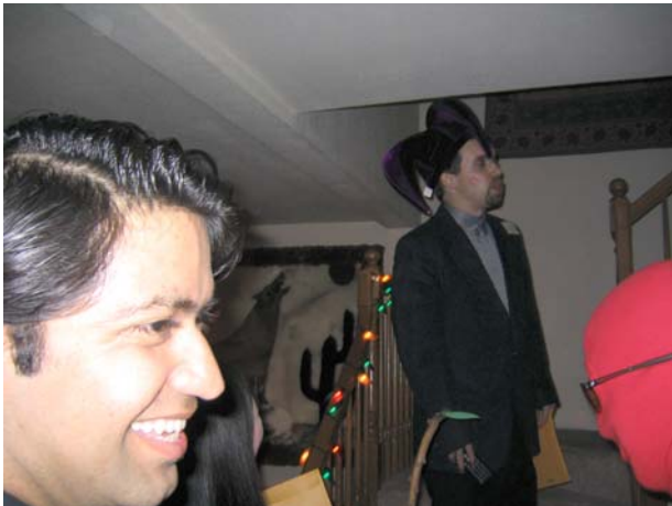
Luth & backwards ?'er (stole stick from rampaging Poison Oak)