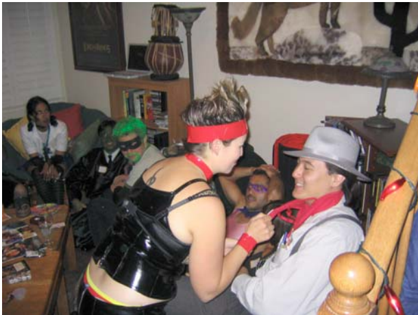
WBWoman using her "bra" of truth on Kingpen to many onlookers