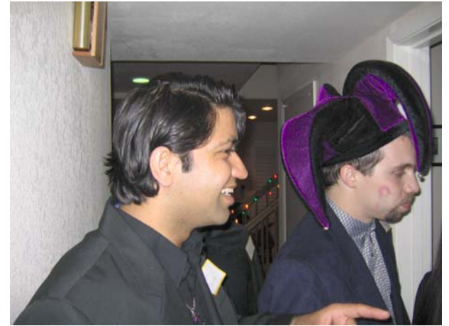
Luth & ?'er (aka put ? on face backwards in mirror)