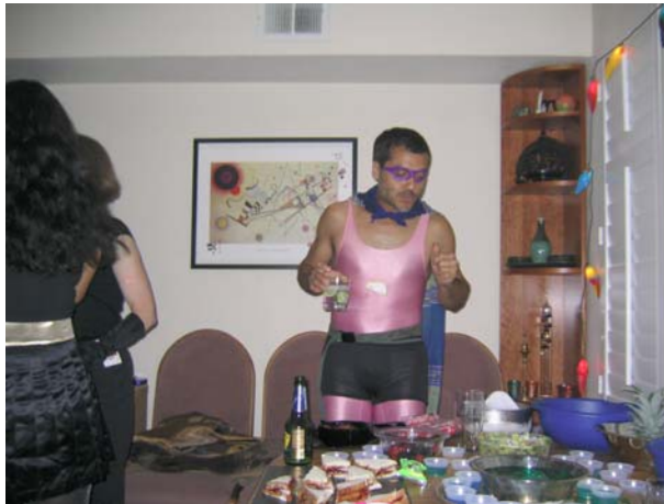
Badman - which one to eat first?