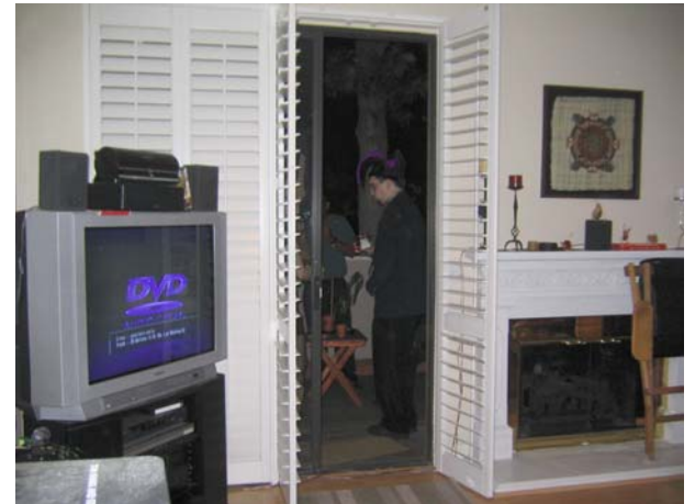
Questioner outside with Greatest American Hero theme music