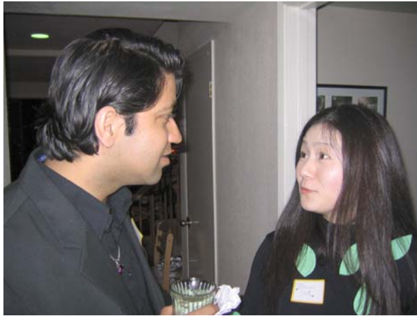
Luth & Poison Oak