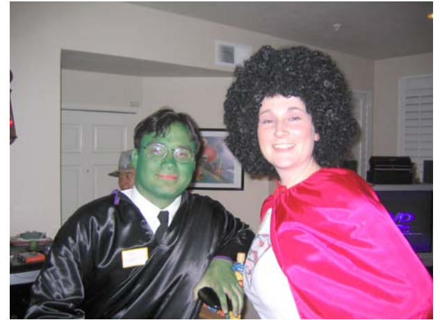
The Hunk & SuperCurl