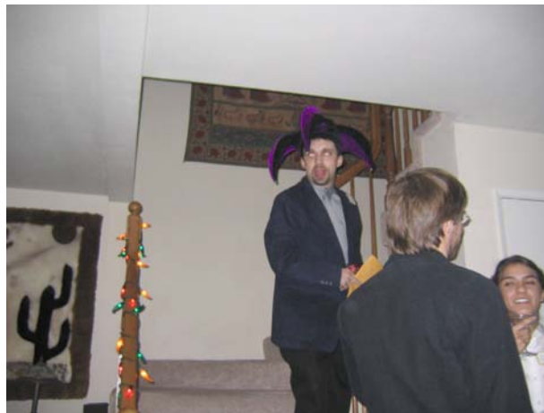
?'er having an out-of-body experience (who's he flipping off?)